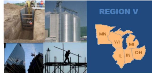
NUMBER OF FATALITIES INVESTIGATED PER STATE FOR FY 2020